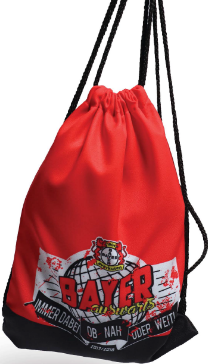
GYM BAG PRINTED